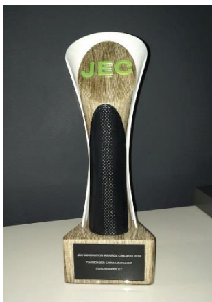
Image 1: On June 27, 2018, the development and manufacture of the hybrid roof bow received the "Future of Composites in Transportation 2018 Innovation Award" in Chicago.